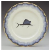
Plate with fish

Possibly Europe, 1935–50 Cotton, machine embroidery Gift of Dina Merrill Hartley, 2014 ( 2014.2.7.13 )