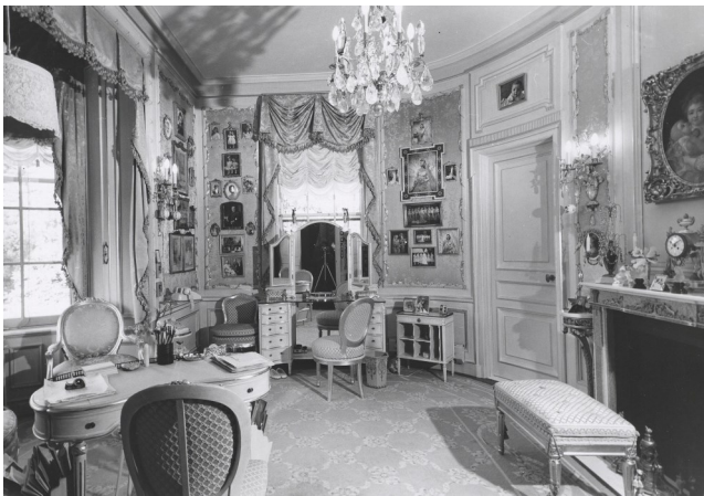
Marjorie Post's Hillwood dressing room

Marjorie Post believed in living a healthy, active lifestyle. She began each day at Hillwood with morning exercises in her dressing room. In the afternoon, she walked her garden paths for exercise.