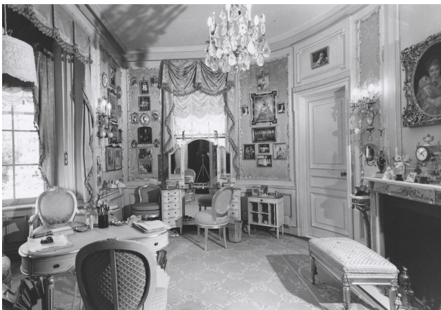
Marjorie Post's Hillwood dressing room, where she ate a healthy breakfast and did exercise each morning.