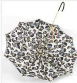
Umbrella ONM Paris (French, active 1950s–60s) Paris, 1960s Nylon, brass, reptile skin ( 2014.11.5 )