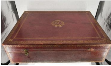
Custom traveling case for the Orlov Service Brussels or Paris, 1900s Leather, brass, wood, doeskin (2023.4.1-2)