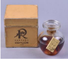
Carnet de Bal perfume and box Revillon Frères (French, 1723–1982) Paris, ca. 1940 Glass, paperboard Museum purchase, 2018 (2018.4-4a)