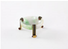
Pin tray Cartier (French, 1847–present) Paris, ca. 1935 Jade, silver gilt, enamel, rubies (21.160)