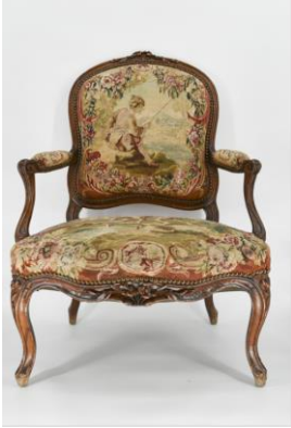
Armchair Beauvais Tapestry Manufactory (French, 1664– present) Paris, ca. 1755 Walnut, tapestry (31.68)