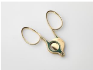
Cigar cutter Cartier (French, 1847–present) 1911 Gold, enamel (11.27)