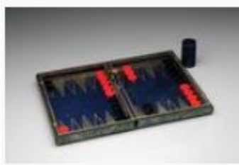
Backgammon board and accessories Cartier (French, 1847–present) Paris, early 1920s Wood, leather, cardboard, Bakelite, metal (2014.17)