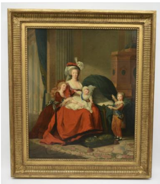
Portrait of Marie Antoinette and children After Élisabeth Louise Vigée Le Brun, painter (French, 1755-1842) Probably France, after 1787 Oil on canvas ( 51.8 )