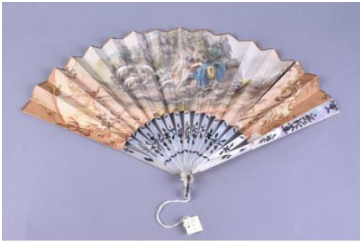
Fan Probably Paris, 1800s Watercolor and lithograph print on paper, mother-of-pearl (49.23)