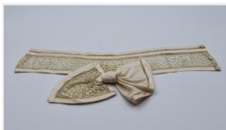
Jabot collar Martial (French, 1893–1902) Paris, ca. 1900 Linen needle lace, silk satin (2023.3)