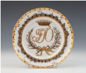
Pieces from the Orlov Service Imperial Porcelain Factory (Russian, 1744-1917) St. Petersburg, 1762-65 Hard-paste porcelain ( 25.231.1 , 25.236.1-2 )