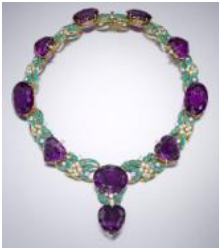
Necklace Cartier (French, 1847–present) New York, 1950 Amethysts, turquoises, diamonds, gold, platinum ( 17.67.1 )