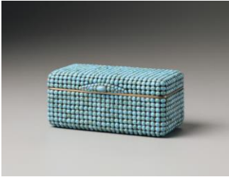
Gold and turquoise box Carl Helfried Barbé (German, b. 1777) St. Petersburg, ca. 1810 Gold, turquoise ( 11.104 )