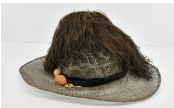
Hat Madame Georgette (French, active 1900–1940) Paris, 1910 Oxidized lace, ostrich feathers, silk velvet ribbon, taffeta flowers (2012.9.6)