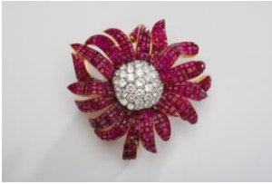
Brooch Van Cleef & Arpels (French, 1896–present) Paris, 1969 Rubies, diamonds, gold, platinum (17.80)