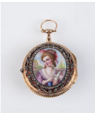
Watch Esquivillon Frères & De Choudens (active 1770s– 1830s) Paris, ca. 1780 Gold, enamel, diamonds, glass (16.5)