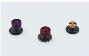
Legion of Honor rosettes and ribbon bars Maison Boullanger (French, active 1866–?) Paris, late 1950s Printed paper, adhesive, tissue, silk, copper (2023.6.1-5, 2023.7.1-28, 2023.8.1-22)