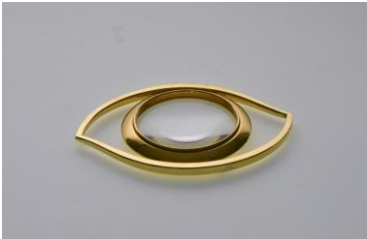
Eye-shaped magnifying glass Hermès (French, 1837–present) Paris, mid-1900s Gilt metal, glass (14.98)