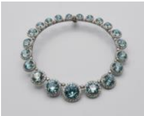
Necklace, bracelet, and brooch Joël Helft (French, active 1920s–1930s) Paris, 1939 Zircons, diamonds, platinum (17.72.1, .2, .5)