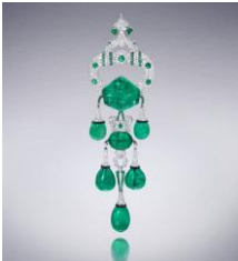
Pendant brooch Cartier (French, 1847–present) London, 1923; purchased, New York City, 1925; remounted, 1928 Emeralds, diamonds, platinum, enamel ( 17.75 )