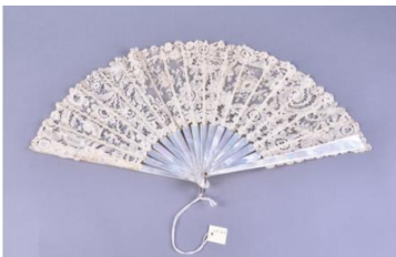
Fan Probably Paris, 1900s Bobbin lace, mother-of-pearl (49.22)