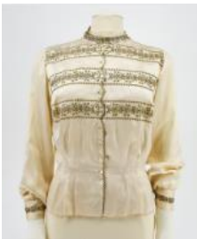
Blouse Pache (French, active 1940s–50s) Paris, ca. 1947 Silk satin, cotton embroidery, mother-of-pearl buttons (2023.2)