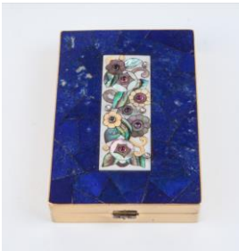
Case Cartier (French, 1847–present) Paris, ca. 1920 Gold, lapis lazuli, mother-of-pearl, rubies (11.187)