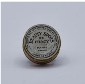
Beauty patches F. R. Arnold & Co. Importers (American, active 1866–1920s) New York, ca. 1904 Velvet, adhesive, printed paper (2023.5.1-24)