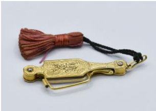
Lorgnettes Paris, 1900s Gold, tassel, glass (11.208)