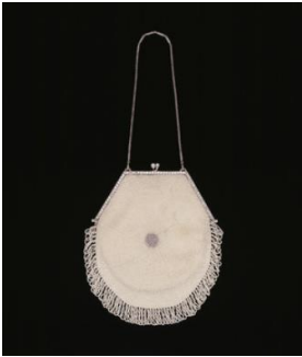
Handbag Cartier (French, 1847–present) Paris, 1946 Seed pearls, doeskin leather, platinum, diamonds Gift of Dina Merrill Hartley 1993 (49.4)