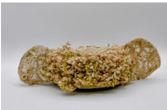
Hat Maison Caroline Reboux (French, active 1870–1956) Paris, 1895 Handmade lace, silk flowers, tulle, velvet, ostrich feathers, wire, buckram (2012.9.27)