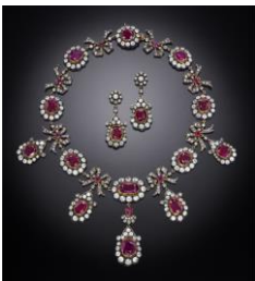
Demi-parure of earrings and necklace Probably French, 1800–1825 Rubies, diamonds, silver, gold ( 17.71.1 , 2–3 )