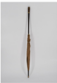
Parasol DeWailly (French, active 1910s) Paris, ca. 1915 Silk, wood, Bakelite, brass ( 2014.11.1 )