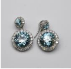
Earrings and ring Purchased from de Sedles (American, active 1920s–70s) New York, 1936 Zircons, diamonds, platinum ( 17.72.3 , .4 , .6 )