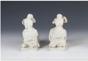
Pair of sphinxes France, late 1800s–early 1900s Biscuit porcelain ( 24.168 )