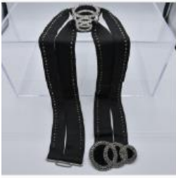
Belt Martial (French, 1893–1902) Paris, ca. 1900 Corded silk, steel-cut beads, velvet, silver, leather ( 2014.6.7 )