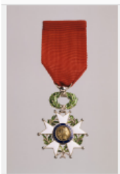
Chevalier, Légion d'honneur (Legion of Honor) France, 1957 Enamel, gold, silk moiré ( 18.78.1 )