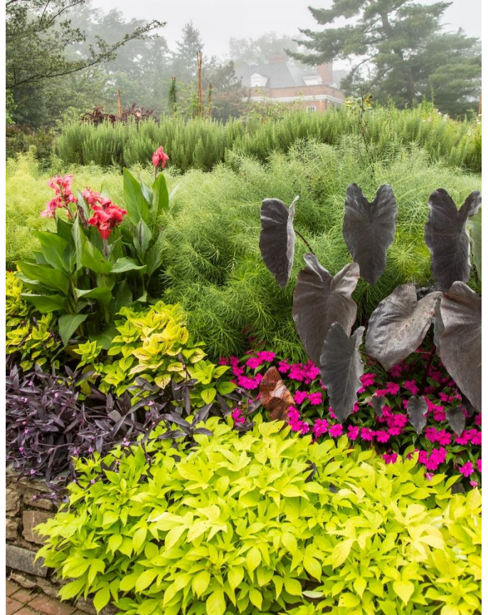
Hillwood Estate, Museum & Gardens

Marjorie Merriweather Post enjoyed displaying flowers throughout her home and this tradition continues today, according to her wishes.