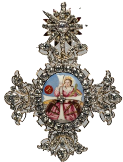
Grand Cross of the Order of St. Catherine Russia, late 1700s Gold, silver, enamel, diamonds (18.5)