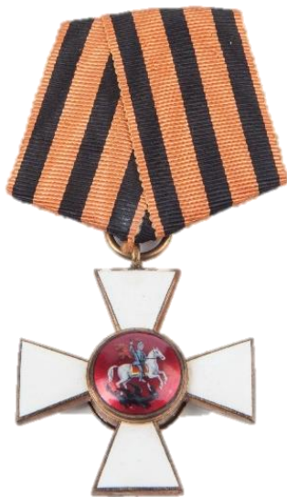
Cross of the Order of St. George Europe, after 1917 Gold, enamel, ribbon (18.110)