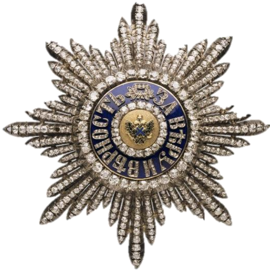
Star of the Order of St. Andrew St. Petersburg, 1800s Gold, enamel, silver, diamonds (18.2)