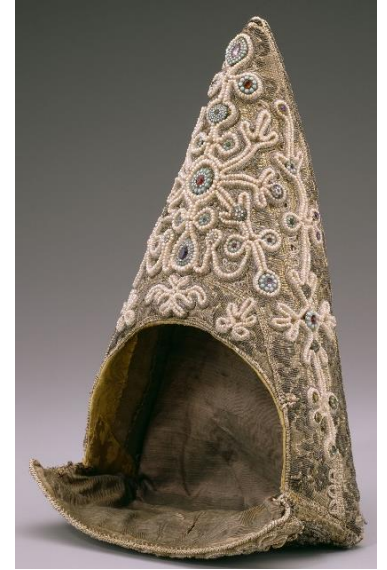
Kokoshnik , Kostroma, Russia, late 1700s-early 1800s, silk, linen, cotton, gold plate thread, gold-wrapped silk thread, silver-wrapped silk thread, seed pearls, turquoise-colored stones, colored pastes (47.52)

In this painting a bride and groom stand at the head of the table at their wedding feast. They are boyars, who were a group of powerful, rich Russians from long ago.