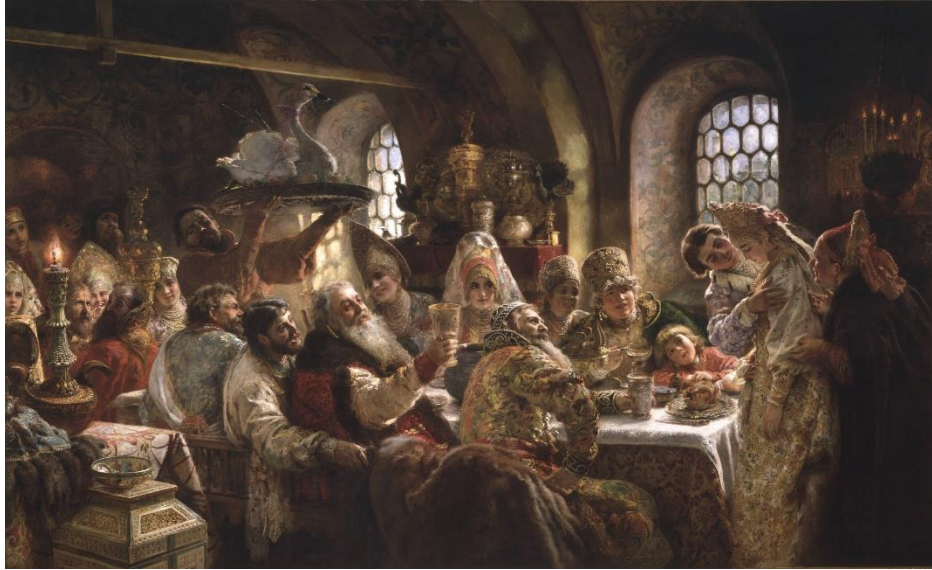
A Boyar Wedding Feast , Konstantin Makovsky, St. Petersburg, 1883, oil on canvas (51.79)