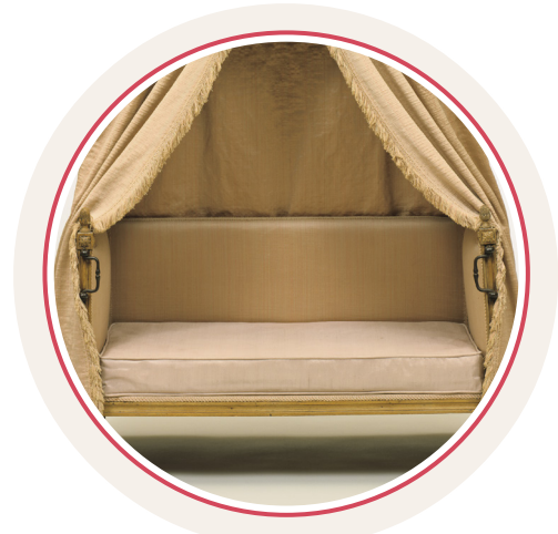
C LIBRARY (FIRST FLOOR)

Marjorie Post had a photograph taken of Scampi, her pet dog, sitting on this bed. Can you find the photo on a nearby table?