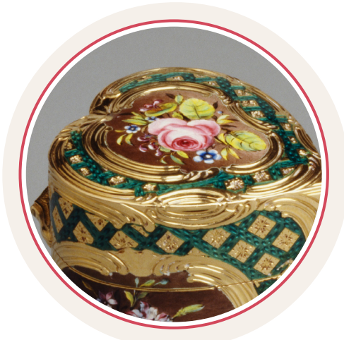
A FRENCH DRAWING ROOM

Marjorie Post loved gold boxes like this one. As the owner of Postum Cereal Company, she was able to afford lots of beautiful things and create an art collection.