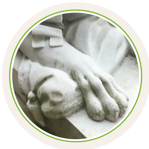
B FRENCH PARTERRE

This paw belongs to an imaginary creature called a sphinx (pronounced sfinks), which is part lion and part human. Hillwood's sphinx has a fancy hairstyle and clothes from long ago.