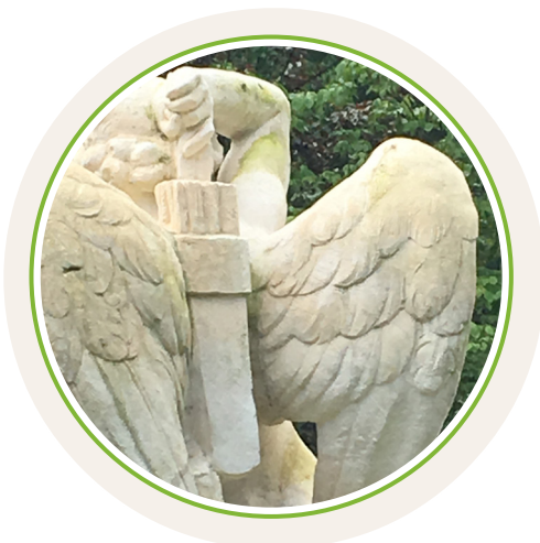
A MOTOR COURT

Eros (pronounced air-rows), the winged god of love, greets visitors in front of the mansion. He is also called Cupid. In this statue, he pulls an arrow from his quiver, the case on his back.