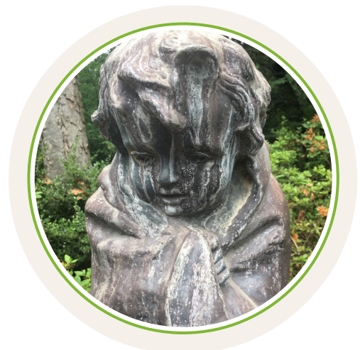
C FOUR SEASONS OVERLOOK

This child is wrapped in a blanket to keep warm in winter. Walk to the right in a circle to find statues for the other three seasons: children with flowers for spring, grain for summer, and grape-vines for fall.